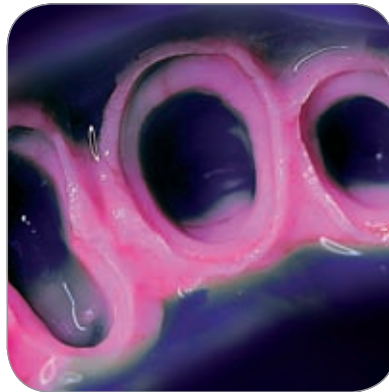
Fig. 18 Impression: all contours are clearly visible

As an alternative or in addition to the use of threads, electrotomy or laser techniques can also be used to expose the prepared margin, whereby all forms of retraction must be as gentle as possible, especially in areas where the gingiva is visible. With the electrotomy method it is advisable to use the thinnest instrument available to open the sulcus. The subsequent impression should be taken using customised or individual impression trays.