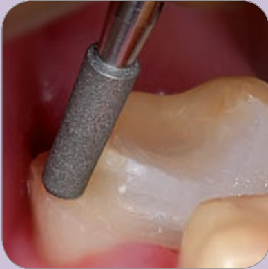
Fig. 10 Step 3: Short finishing bur for partial crowns and less accessible areas