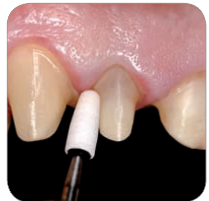
Fig. 14 For special cases a ceramic abrasive is customised with a diamond abrasive