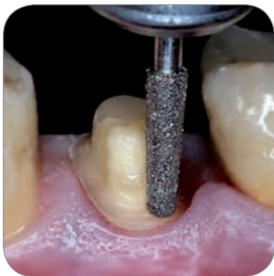
Fig. 5 Step 1: Initial preparation using a coarse diamond bur for the posterior region

Tip! An accentuated preparation margin in its final position serves as a guide for the final stages of the preparation. This initial shoulder and chamfer will subsequently guide the instrument smoothly, even in less accessible areas.