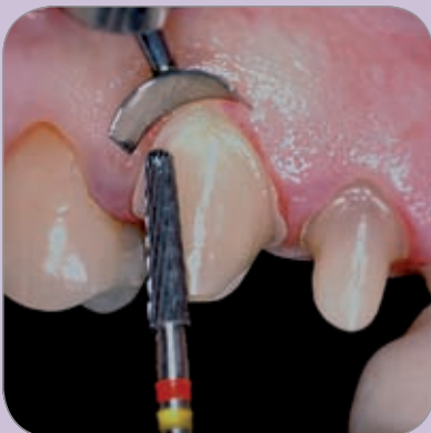
Fig. 12 Step 3: Special carbide finishing bur; an ergonomic instrument for anterior and posterior regions