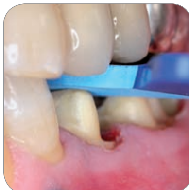
Fig. 9 Checking the space created by means of a bit registration