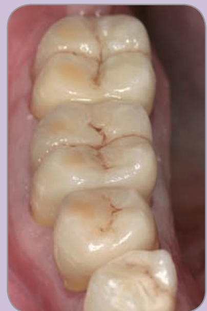
Fig. 3 After: ZENO crowns in situ