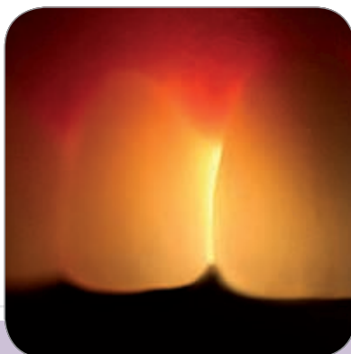
Fig. 22 High translucence and light transmission into the sulcus and the gingiva