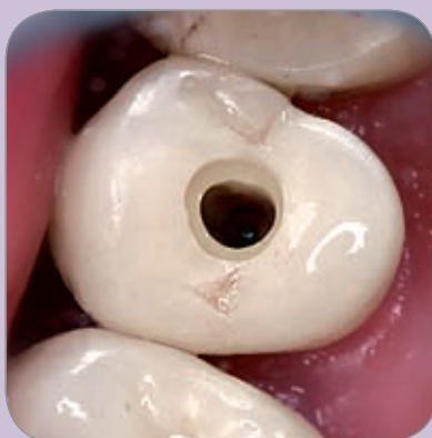
Fig. 23 Trepanation of a ZENO crown; use generous water cooling

in other words at a tangent to the tooth. This ensures that the diamond bur is always adequately-cooled and prevents it from overheating ( Fig. 23 ).