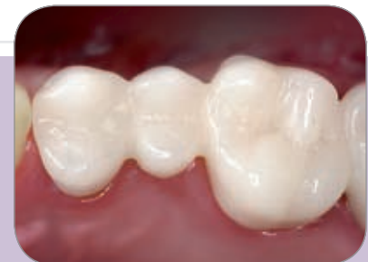
Fig. 19 Temporary restoration

With the ZENO Tec System it is also possible for the technician to make a long-lasting temporary crown from PMMA on the CAD/CAM system within a few hours (Fig. 19).