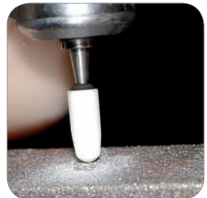
Fig. 15 Finishing the preparation and rounding all edges