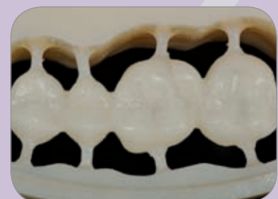
Fig. 20 Temporary restoration made from ZENO Tec PMMA

Finally the temporary restoration is lathe polished to a high lustre and fixed onto the prepared teeth with eugenol free cement (Fig. 20)