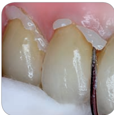
Fig. 21 Cementing with dual cement; the excess is easy to remove

■ In special cases, it may be advisable to try in the zirconium oxide framework before completing the restoration. When doing so, check the marginal fit by applying a thin-flowing impression material to the gap between the prepared tooth and the restoration. Then clean the framework with alcohol to ensure that no traces of silicone are left inside the restoration. After the impression material has set, remove the restoration from the mouth. If the marginal fit is a good one, the material will tear off cleanly at the crown margin. At this stage, a refit can be carried out using the zirconium oxide framework as a basis.