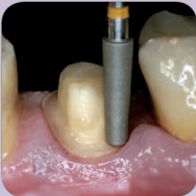
Fig. 11 Step 3: Tapered diamond finishing bur for molars