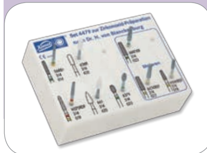
Fig. 4a Ergonomic preparation set according to Dr. H. v. Blanckenburg

The largest circumference of the prepared tooth is clearly visible in the area of the gingival preparation margin. It does not matter here whether the preparation has a distinct chamfer or is a shoulder with a rounded inner edge. At the margins the cut should be circular with a uniform depth of 1.0 mm.