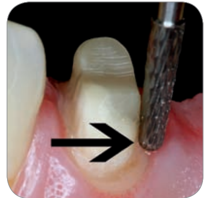
Fig. 13 Extremely safe and atraumatic finishing of the accentuated chamfer