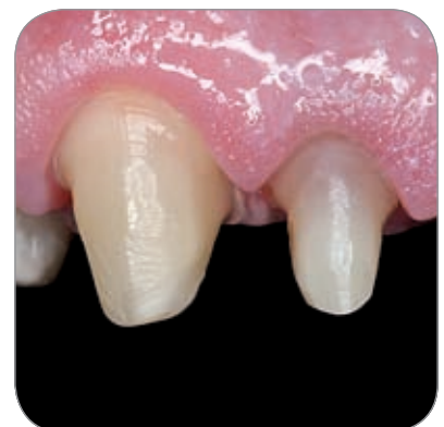
Fig. 16 The finished preparation