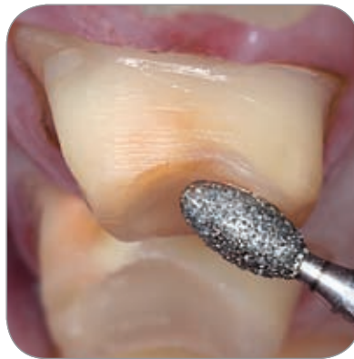
Fig. 8 Step 2: Removal of occlusal hard substance from molars