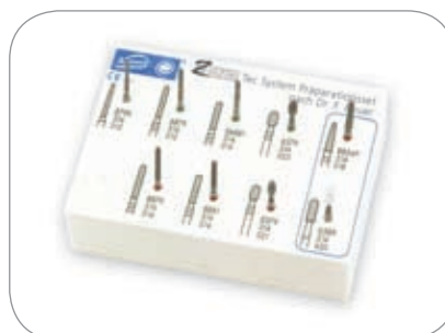
Fig. 4b ZENO Preparation set according to Dr. Beuer