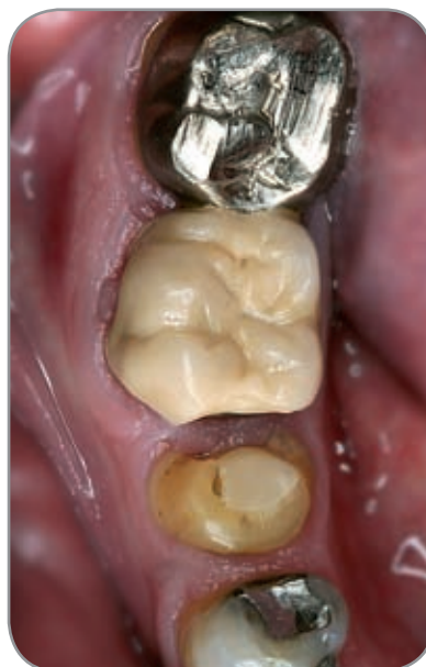
Fig. 2 Before: Inadequate restoration in the posterior region

If the patient suffers from bruxism, the practitioner must decide on a case by case basis whether a full ceramic restoration is suitable or whether a metal occlusal surface is preferable.